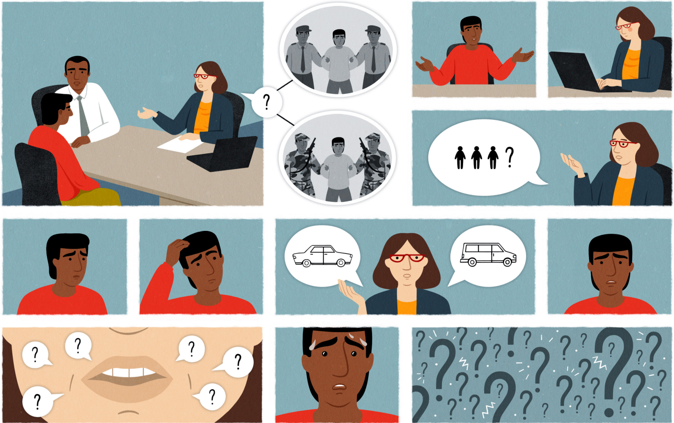
The case worker at the Immigration Service will ask you a lot of questions. You may expect very detailed questions about your reasons for seeking asylum.