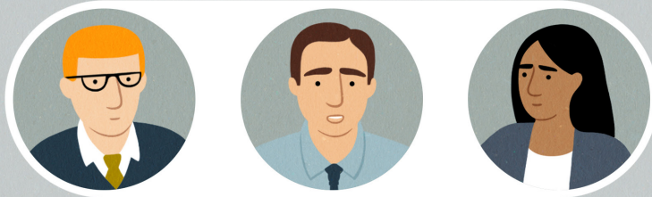
Refugee Appeals Board