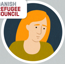
Danish Refugee Council